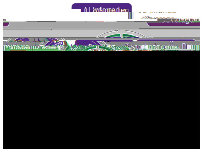
Figure 2: VSO.ai delivers faster, higher coverage closure and analytics

Synopsys VSO.ai revitalizes the coverage process by using AI to examine the RTL and infer coverage while also highlighting areas where coverage is needed, ultimately helping verification engineers reach coverage targets faster and find more bugs. Regressions are optimized so high ROI tests are run first and analysis is automated to define prescribed insights. Customers report achieving up to 10x improvement in reducing functional coverage holes and up to 30% increase in IP verification productivity using AI-driven verification with Synopsys VCS® functional verification solution.