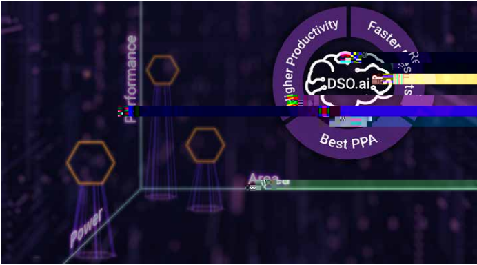
Figure 1: DSO.ai provides unbeatable PPA results and the fastest time to design

Complexity brought on by advanced process nodes have opened the door to challenges in achieving optimal power, performance, and area. Manual methods are no longer viable given shrinking market windows. The need to drive for better